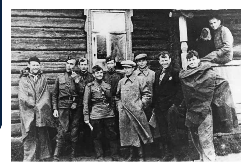
Front brigade of Estonian artists near Velikiye Luki, Russia (1943). Estonian Art Museum, ref. no. EKM i 55320 FK 610.

out by special assignment groups (оперативная группа, operativnaya gruppa) moving behind the Red Army units. These groups included the personnel of a specific agency or local authority, who had already been appointed to their positions in the Soviet rear. Alongside recruitment, another primary task of the special assignment groups was to prepare for the registration of war damage and to organise the re-evacuation of assets evacuated from Estonia to the Soviet rear in 1941.