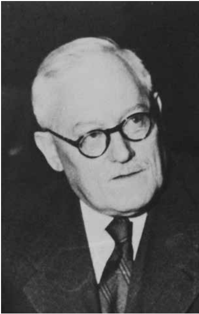
Andrey Vyshinski, attending the UN session (1946–1948). National Digital Archives, Warsaw, Poland, collection Socjalistyczna Agencja Prasowa, ref. no. 3/3/0/1/209

describe some of these events in Latvia, but similar processes also took place in Estonia and Lithuania, in the summer of 1940.