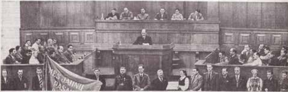
Заседание Верховного Совета СССР. В центре — И. В. Сталин. Справа — Председатель Верховного Совета СССР Лаврентий Берия. На заднем плане — члены Президиума Верховного Совета СССР.

Да здравствует свободный латвийский народ, вступивший в дружную семью народов СССР! Да здравствует Великий Советский Союз—надежда и оплот трудящихся всего мира!